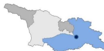
In terms of personnel strength, Field Office Mtskheta is the smallest of the Mission's three Field Offices, but it has the largest Area of Responsibility (blue).

Tbilisi to Rustavi and Azerbaijan in the southeast on its way to the Caspian Sea. Samtskhe-Javakheti and Shida Kartli in the south have large settlements of ethnic Armenians and Azeri. The majority of Ossetians live in South Ossetia, which also has a significant Russian military presence.