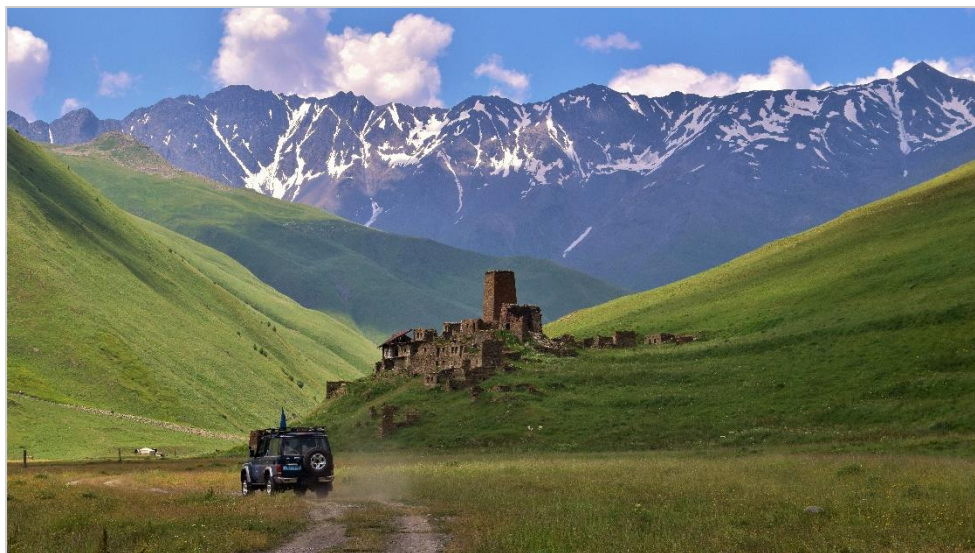
Monitors from Field Office Mtskheta patrol the entire Eastern Georgia, as here in Truso Valley.

As Georgia's capital Tbilisi is located nearby, the Field Office has close contacts with various civil society organization and government institutions. Field Office Mtskheta is also the main contributor to the Mission's mandated task to monitor the Georgian Military and Police Forces and their compliance with the 2008 Six-point Ceasefire Agreement as well as the separate agreements between the Mission and the Georgian authorities, aimed at providing full transparency of military