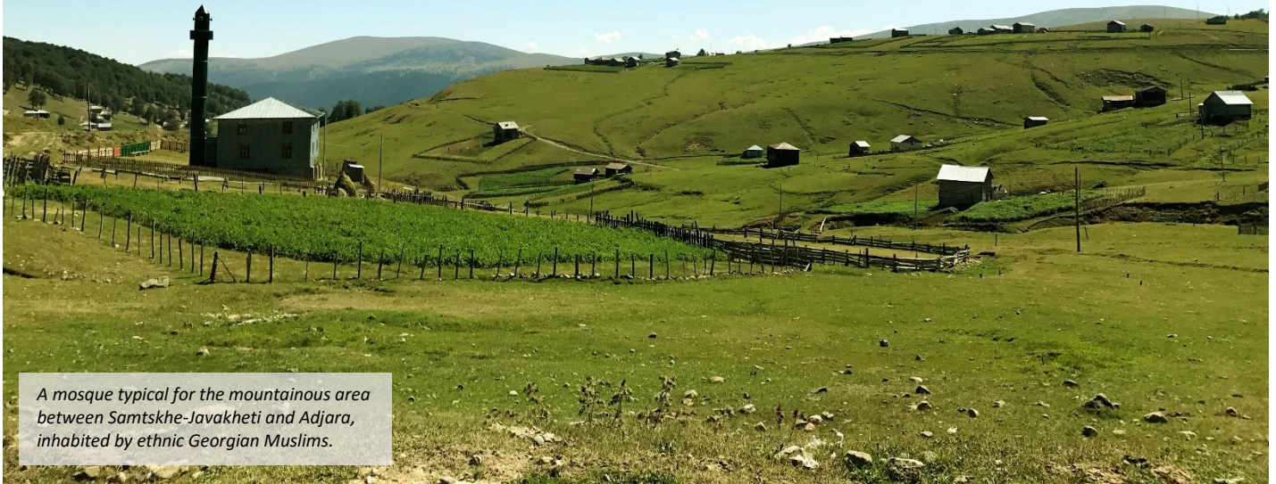
A mosque typical for the mountainous area between Samtskhe-Javakheti and Adjara, inhabited by ethnic Georgian Muslims.

Additionally, there are approximately 19,000 Catholics in Georgia, 12,400 Jehovah's Witnesses, 8,600 Yazidis, 2,500 Protestants, and 1,400 Jews.