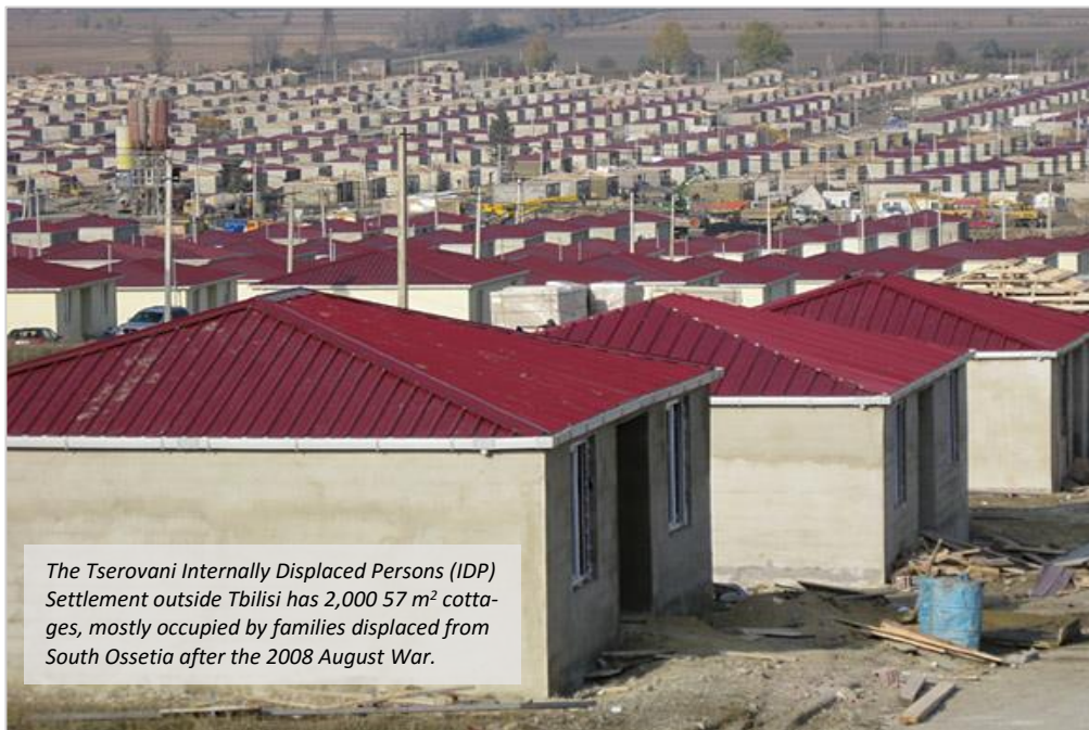
The Tserovani Internally Displaced Persons (IDP) Settlement outside Tbilisi has 2,000 57 m 2 cottages, mostly occupied by families displaced from South Ossetia after the 2008 August War.

Over the course of time, the living conditions in some IDP communities have improved substantially. However, every week or two, the Human Security Team talks to families whose living standards do not meet criteria for a safe and acceptable housing solution.