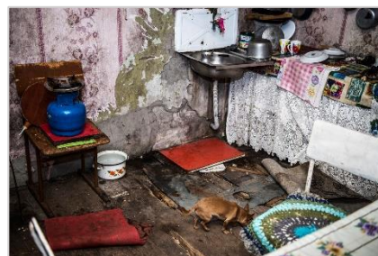
Every week or two, the Mission's Human Security Teams find families whose living conditions are horrendous. The above photo depicts one of the cases, which our monitors meet regularly.

Georgia is a country of contradictions. A genuine hospitality of its people, however, is a common attribute. The most valuable information often comes by accepting an invitation to someone's home or supra (traditional Georgian hospitality meal).